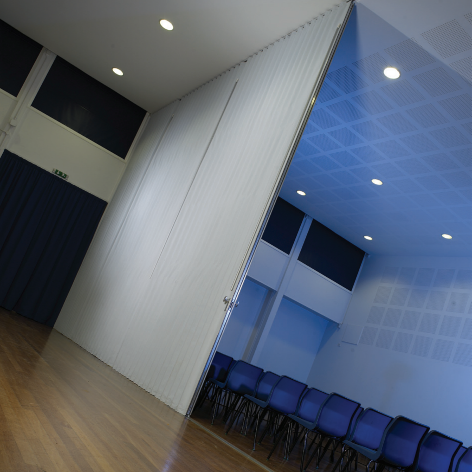
A wide-line fabric partition is used here to divide a large classroom into two functional teaching spaces.

“I can now divide our hall into three separate rooms in seconds.”